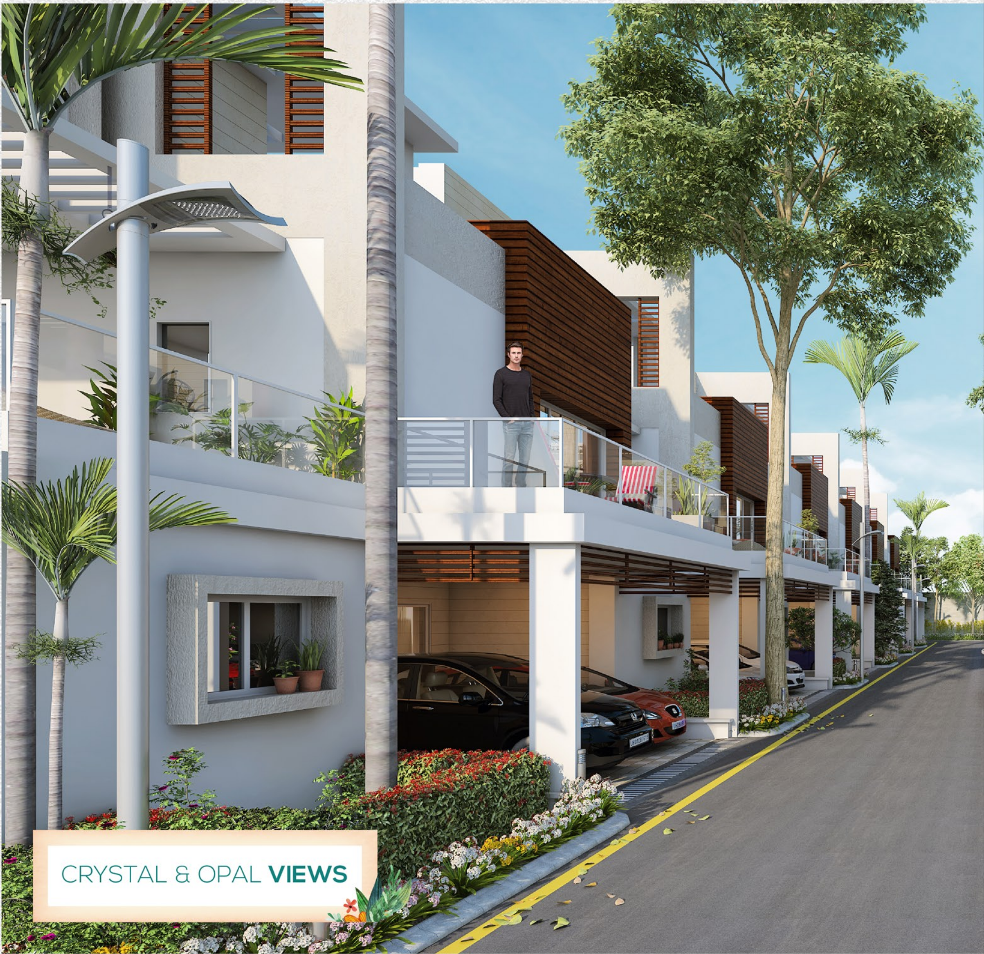
CRYSTAL & OPAL VIEWS