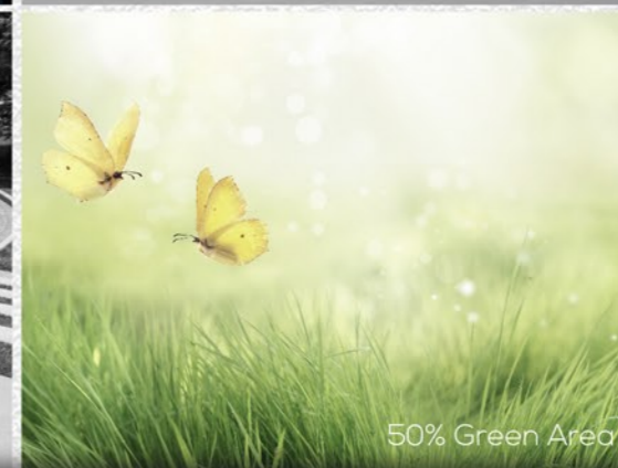
50% Green Area