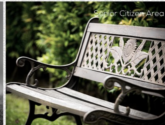
Senior Citizen Area